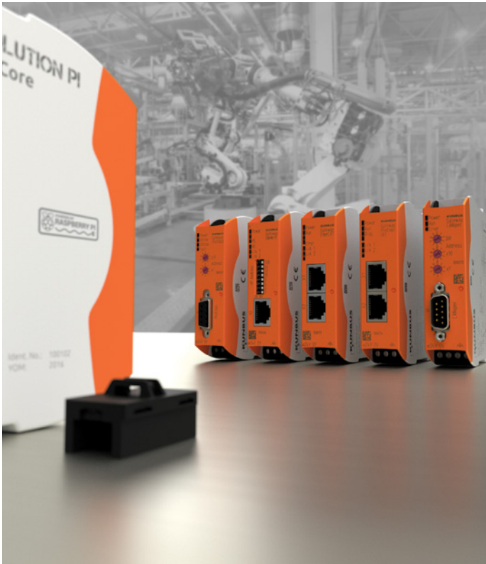
Available for all common industrial network protocols, the RevPi Gates help to integrate Revolution Pi into an industrial network.

In addition, the outputs can be configured so that an open load detection (line break) is also switched on and a corresponding alarm is transmitted to the RevPi Core for high-side output type. Just like the inputs, the outputs are also protected against static discharges, burst and surge impulses in accordance with EN61131-2 requirements.