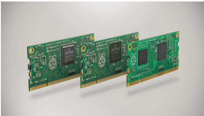
Raspberry Pi Compute Module 1, 3 and 3+.

Raspberry Pi has had an impressive career ever since its launch early 2012. Until mid-2019, the small and inexpensive single-board computer was sold more than 25 million times.