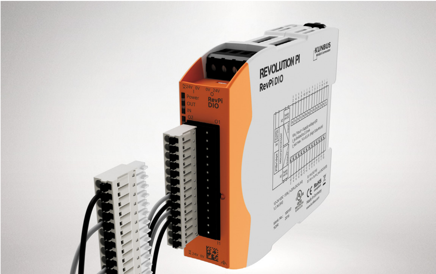
Digital I/O module RevPi DIO with 14 inputs and outputs.