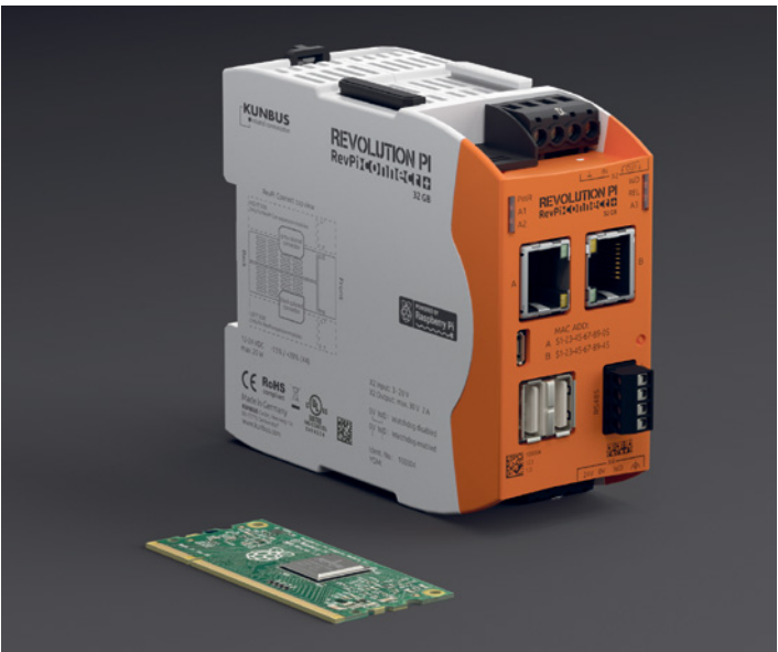
At 45mm, the RevPi Connect is twice as wide as the RevPi Core 3.

The RevPi Connect also has a 4-pole RS-485 interface on the front, for example to connect Modbus sensors.