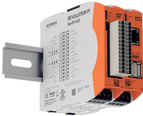
RevPi Core 3 and RevPi AIO on DIN rail.

Just like the digital IO modules, RevPi AIO is protected against disturbances according to EN61131-2 and can be operated between -40 °C and +50 °C ambient temperature and up to 80 % relative humidity. It is also protected against static discharges, burst and surge impulses in accordance with EN61131-2 requirements.