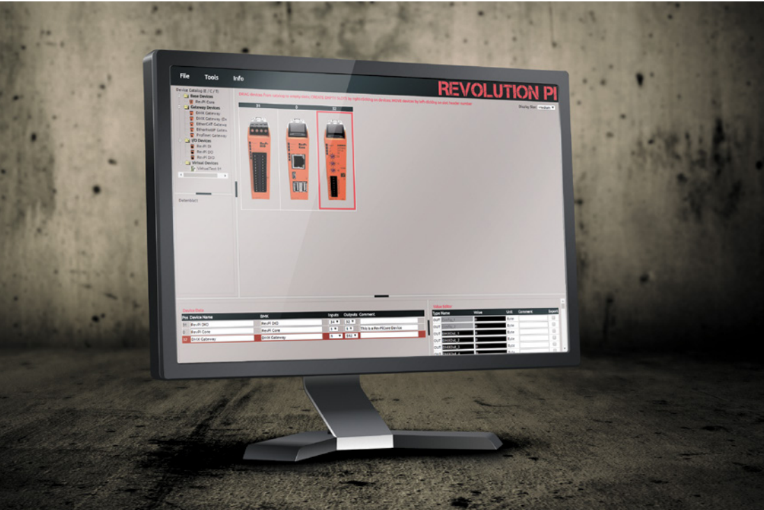
PiCtory helps you to set up your Revolution Pi system.

PiCtory also supports you when defining, for example, all I/O signals. You can assign symbolic names and define which adapter supplies and retrieves the data. An adapter can be a hardware module on the PiBridge but it can also be a "virtual device" – driver software for example – for which the memory location is reserved in the process image and for which process values can be defined with symbolic names. The finished configuration file is stored as a JSON file.